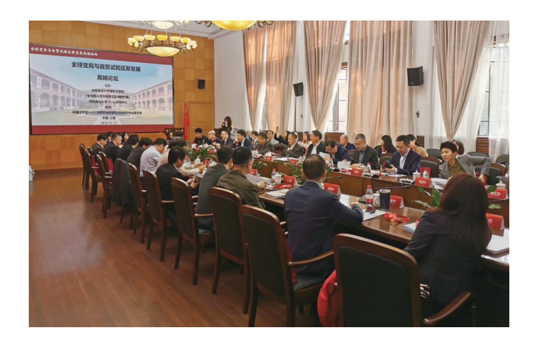
Summit Forum on Global Change and New Development of Free Trade Zone (2019)